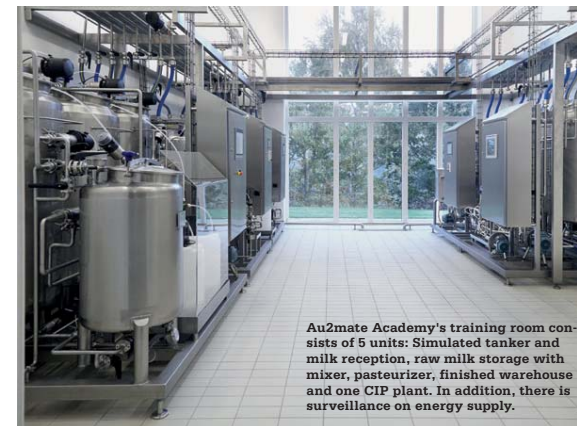
Au2mate Academy's training room consists of 5 units: Simulated tanker and milk reception, raw milk storage with mixer, pasteurizer, finished warehouse and one CIP plant. In addition, there is surveillance on energy supply.